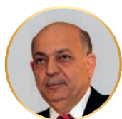
H.E. Thamir Ghadhban Deputy Prime Minister for Energy & Minister of Oil Federal Government of Iraq (TBC)