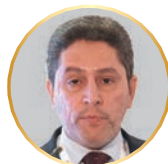
H.E. Engineer Mohammed Al Tamimi First Deputy Governor of Basra Governorate of Basra Federal Government of Iraq