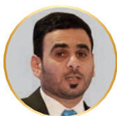
Ali Shadad Al Fares Head of the Energy Committee Basra Council Federal Government of Iraq