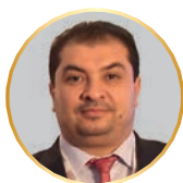
Aamer Al Mousawi Chief of Experts Iraq National Security Advisory Federal Government of Iraq