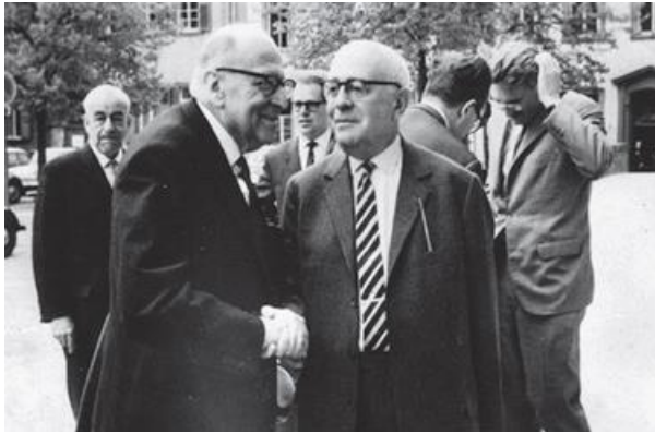
Horkheimer and Adorno

Adorno started his philosophical project by cooperating with Horkheimer. He started from a critical stand and started to analyse the reasons for the failure of the bourgeoisie revolutions in Europe. But he changed after that to the study of the theory of knowledge and aesthetics to combat the Nazi ideology and its applied forms which it has nurtured and developed to extend its totalitarian hegemony over society. He directed his attack against the traditional philosophy which has been emptied of its revolutionary function and role. Philosophy, as Adorno sees it, has become a superstructure for Idealist systems as it has been represented in the ideas of the Marburg school of philosophy, Existentialism and Positivism . These trends which came under attack by Adorno, made human beings sieged by the contradictions of Subjectivity and Identity , and pushed Adorno to the study of condition of the oppressed and alienated individual and the problematic of his consciousness, in an attempt to get philosophy out of its irrelevant formal situation and to present an example of material analysis, which was a negative stand to the methodical German Existential philosophy as represented by the Ontological Existentialism of Heidegger, as well as, Karl Jaspers.