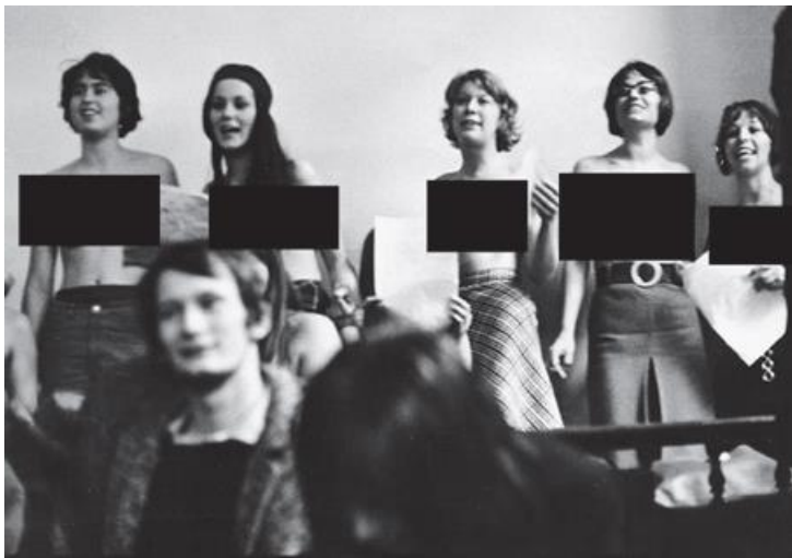
Female students bar their chest

Writing on the protests of the student movements in the late sixties when I was a sociology student at Frankfurt University in Western Germany (then), reminded me of one important incident that I witnessed closely . Adorno started giving his talk on aesthetic when three girls wearing leather jackets approached the stage with red flowers in the hand of each and started to take off their jackets and stood naked and then each one presented her red flower to Adorno in a sarcastic theatrical manner. They were protesting against his views which were purely theoretical and did not touch the praxis in the social reality. He wasn't, for them, a radical intellectual who would get involved with the students in their marches in Frankfurt streets. Instead, he was trying to calm them down with his "revolutionary" views. They accused him of being conservative thinker who made a compromise with the bourgeois. There was no option left to Adorno but to step down from the stage and leave the lecture theatre in a shock. A symbolic tragic end to his philosophical project. He became despondent died few months later after a heart attack. He was in his sixty fifth year.