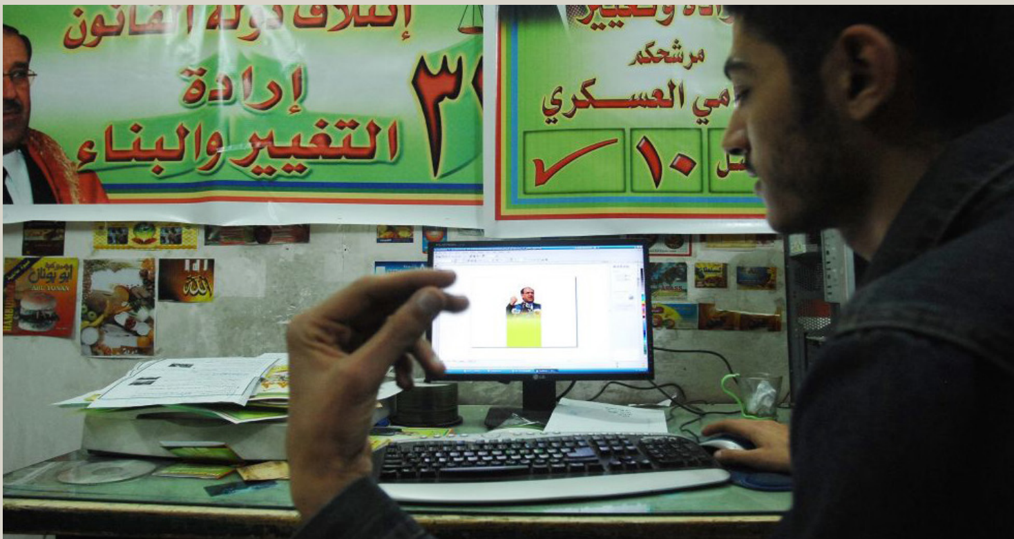
An Iraqi print house worker discusses the design of a campaign leaflet with a candidate's staff while they work the graphics on an office computer on Feb. 3, 2010 in Baghdad, Iraq.

Part of the reason the decentralization process has been so slow and difficult is related to politics and power. The federal government fears that corrupt individuals will embezzle their cash and tribal matters will dictate what money is left and how it is spent. And this has been borne out: as administrative authorities came to the governorates, PC members took advantage of operational budget costing and strong-armed local DGs to hire their preferred candidates through wasta — the Arabic term for having/utilizing “connections,” generally to further political or individual interests — or risk losing their jobs, having family members denied access to jobs and services, or facing intimidation and threats. 43 However, from the governorate