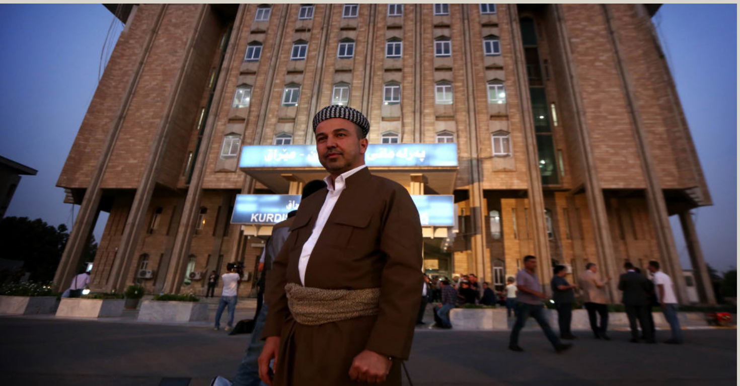
A Kurdish MP stands outside Kurdistan's Parliament building in Erbil, the capital of the autonomous Kurdish region of northern Iraq, on Sept. 15, 2017.

Law 21, passed in 2008, was an attempt to decentralize some ministries to the governorates to effectively kickstart the decentralization process. It was revised in 2011, 2013, and again in 2018, 16 but has yet to be fully implemented. To facilitate this process, the Parliament Committee on Regions and Provinces not Incorporated into a Region is empowered by Article (98) of the Bylaws of the Iraqi Council of Representatives to monitor the affairs of those regions and governorates that are not incorporated into a region and to manage the relationship of these governorates with the federal government. The High Commission for Coordinating among the