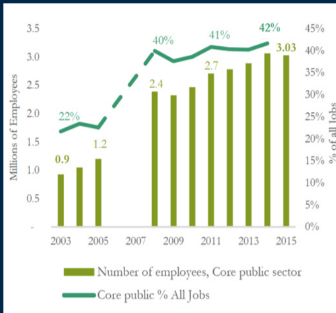
Chart 1: LHS: Core Public Sector Employment 2003-15, RHS: Government Wage Bill 29