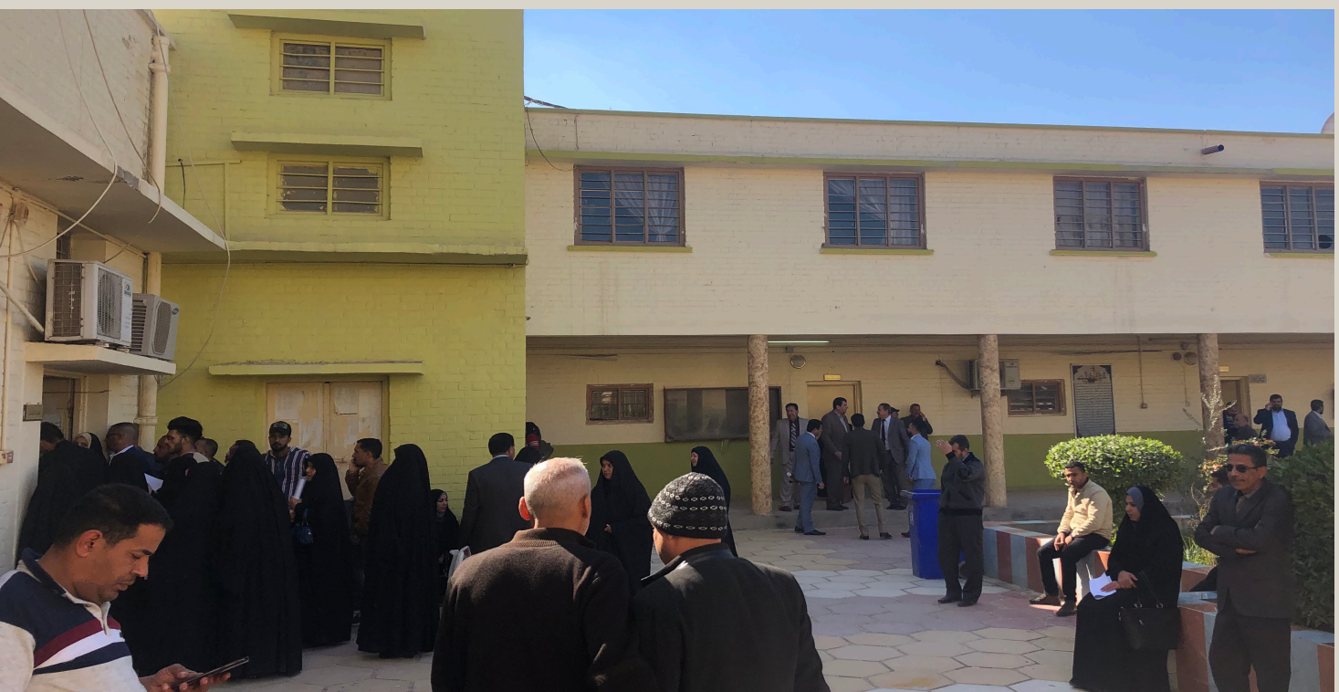
Iraqis waiting to have their paperwork signed at a directorate in Diwaniyah. Much of the paperwork still requires official signatures on physical documents, as different ministries do not accept electronic copies. This results in slow approval on many day-to-day services as paperwork often must be sent to Baghdad and then returned.

Issues permeate the functional relationship between the directorates and the ministries. While the directorates can develop and create their own budget, with assistance and coordination from the Provincial Planning and Development Council, budgets sent to the Ministry of Planning and Ministry of Finance have been ignored or drastically changed — often to the point where the directorate effectively lacks the financial means to decide which programs and projects to engage with and